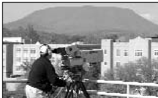
VMI's football game at Army will be carried nationally on one of the ESPN family of networks.

The popular pre-home game tailgate show sponsored by the Keydet Club last season is slated to return this fall. Airtime is one hour before kickoff.